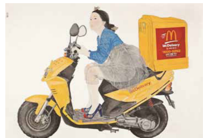
Feign: You move me ©2016 by Kim Hyun-Jung

The APW 2016 also continue with the "Smart Cities" theme which will be featured again by the congress exhibition Metropolitan Solutions (May 31 - June 2, 2016).