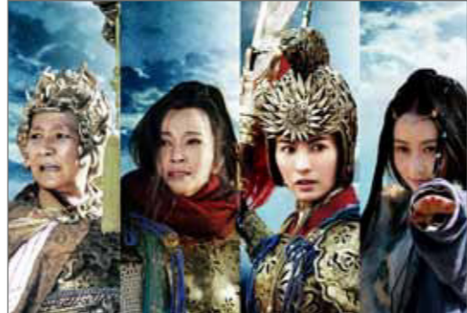
Movie Poster "Legendary Amazons"