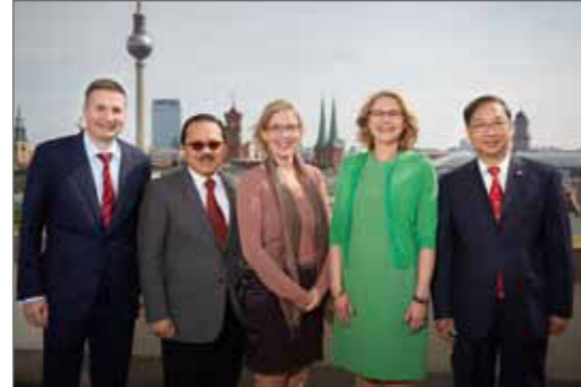
APW 2015

Imprint Publisher: Senate Department for Economics, Technology and Research in cooperation with the Asia-Pacific Forum Berlin and Berlin Partner for Business and Technology Design: eye-solution GmbH | Print: Das Druckteam Berlin As of May 3, 2016 | subject to change