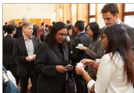
Networking at Embassy Day, APW 2015