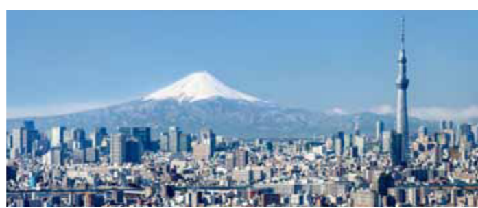
Tokyo Skyline with Mount Fuji and Skytree

For this year's Asia-Europe Innovation Dialogue the APW will bring together entrepreneurs and partners from Asian and European startup ecosystems. We will focus on locations, context, and interaction networks for startups, growth and innovation. Such ecosystems include universities and research institutions as well as founders and conveyors (incubators, accelerators, co-working spaces), VC funds, angel investors and service providers, and established companies as strategic partners.