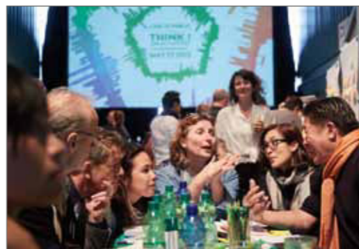
"Labs to Public", APW 2015