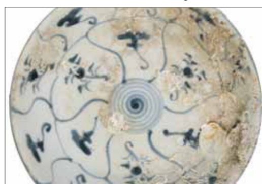
Chinese porcelain, underwater discovery - 1822