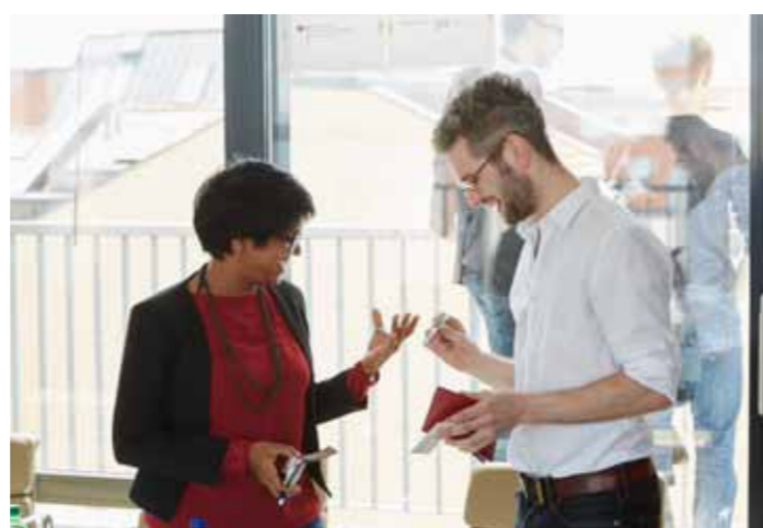
Networking

For this year's Asia-Europe Innovation Dialogue the APW will bring together entrepreneurs and partners from Asian and European startup ecosystems. We will focus on locations, context, and interaction networks for startups, growth and innovation. Such ecosystems include universities and research institutions as well as founders and conveyors (incubators, accelerators, co-working spaces), VC funds, angel investors and service providers, and established companies as strategic partners.